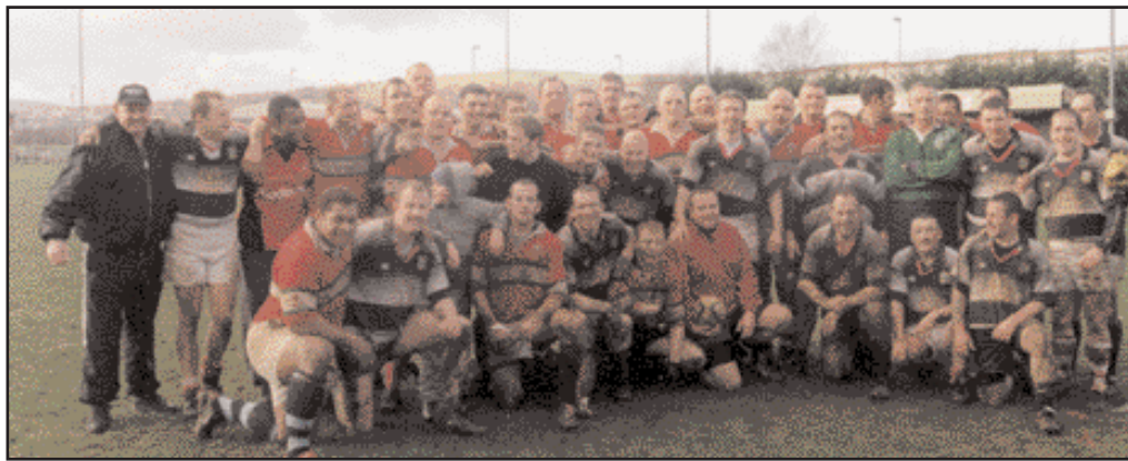
The Past and Present: Ex and serving members play a friendly game of rugby