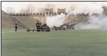
Firing 21 gun Royal Salute

Normally this honour would fall to 100 Regiment Royal Artillery (Volunteers) who are based in Newport and without their expertise, guidance and support the successful firing of the Royal Salute would not have been possible.