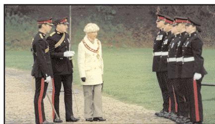
The Deputy Lady Mayor of Cardiff inspects D Sub with the CO